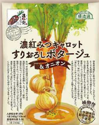
Kokumitsu-Carrot Creamy Soup with Onion