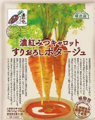
Kokumitsu-Carrot Creamy Soup